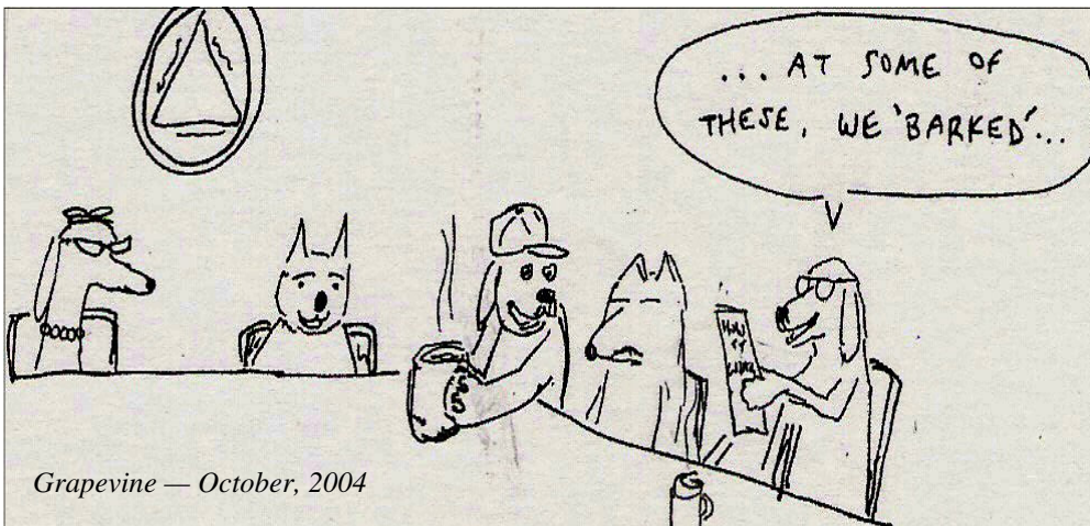
Grapevine — October, 2004