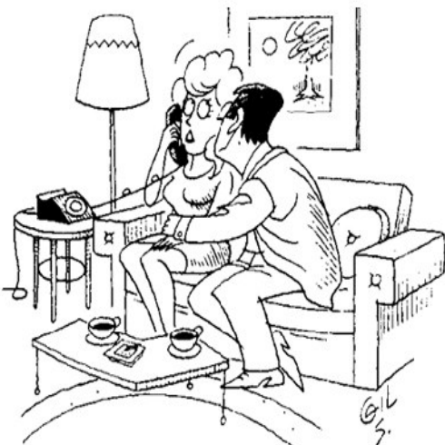
"Marge, he wants to be my male sponsor, what do I say?"

I got up this morning at exactly 6:06. I turned on the news and the weather man said that it was 66 degrees. And then it clicked. I realized I was just turning 66 years old. What is up with that.? I jumped into the convenience store for some gas for the car and chewing gum. The attendant said that will be six dollars and sixty-six cents. I was convinced that God was trying to tell me something. Listening to my inner voice I ran to the local dog track and put sixty-six dollars on number 6 in the 6th race. Well wouldn't you know, he came in 6th.