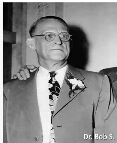
Dr. Bob S.

Rev. Shoemaker worked with Bill and helped him confirm that helping others was what he was to be about. Bill and Ebby worked the Oxford Mission for four months without a single success. Bill became discouraged and told Lois that the "Hot Flash" he had in Towns Hospital must have been a fluke. His effort to help other alcoholics was a complete waste of time and that he had had it with those damn drunks. He was going to get a steady job, get her out of the Department Store, and they were going to start living a normal life.